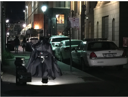
Things that lurk in the night - New Orleans