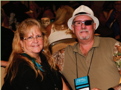
Do we know these people?