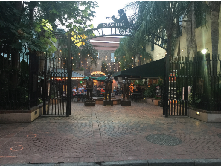
Musical Legends Park - New Orleans