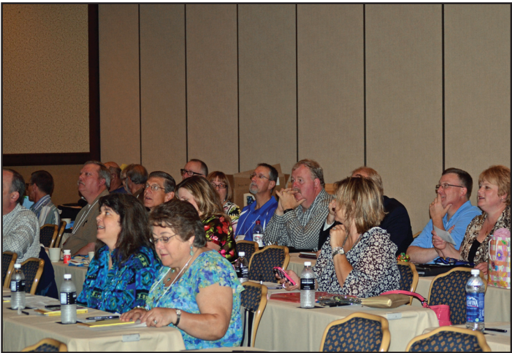
WA State Postmasters attending the General Session at the Summer Convention in Ferndale

Check out all the great rates and loan options at www.napusfcu.org and contact one of our knowledgeable real estate representatives at 800-336-0284 to get started down the path to homeownership at a rate that works for you!